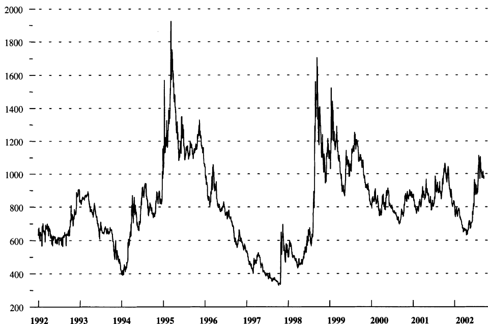
Figure 3. Emerging Market Bond Spread, 1992–2002 (mid-September) (Basis points)